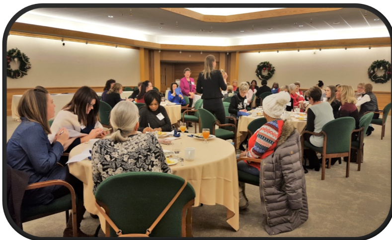
At the Christmas Party Muncie members wrote thank you notes to elementary school teachers in the Muncie schools.